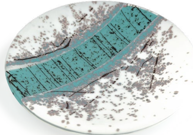
Plate by Patty Gray beautifully illustrates the reaction of Turquoise Frit on Red Reactive Opal